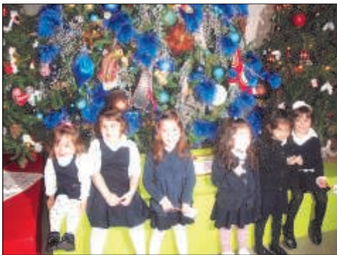
Students had a great time at the Museum of Industry! Some of the students pose in front of the Christmas tree from Greece at the Christmas Around the World Exhibit